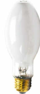
E26 ED17, ED-17P Coated