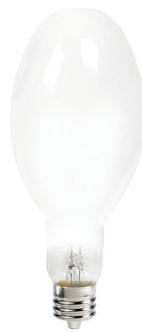
EX39, ED-37, Coated