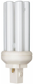
18W, GX24d-2, 2P