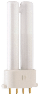
5W, 2G7, 4P