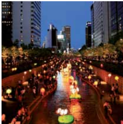
2008 - Seoul - Korea