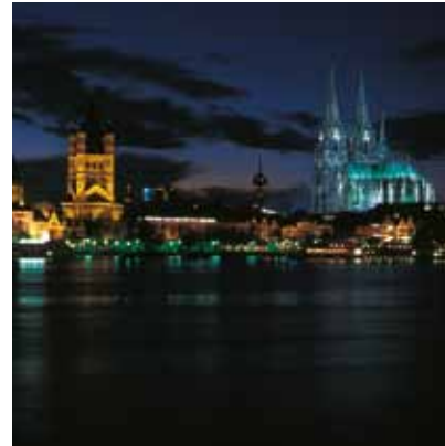
2005 - Cologne - Germany