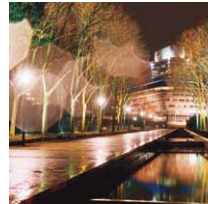
2003 - Cergy - France