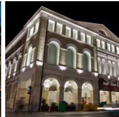
2011 - Valladolid - Spain