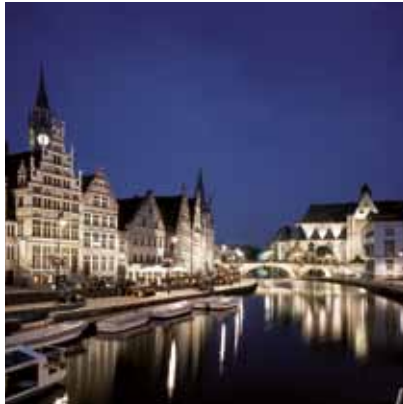
2004 - Ghent - Belgium