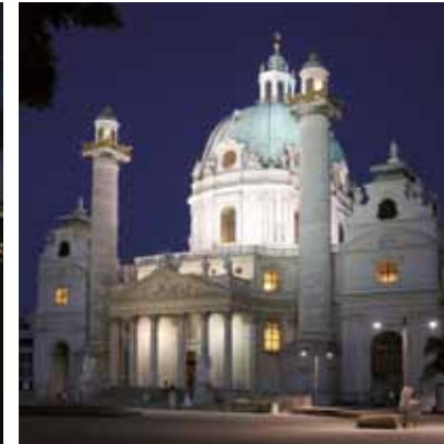
2006 - Vienna - Austria