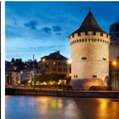
2010 - Lucerne - Switzerland