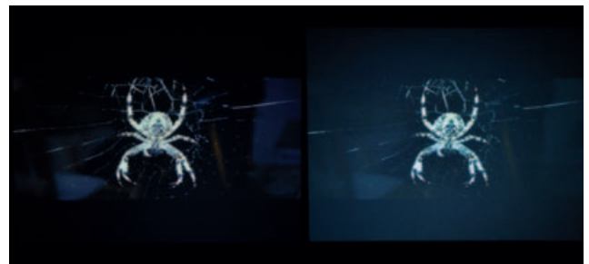
Movie Mode: Improved contrast & energy saving