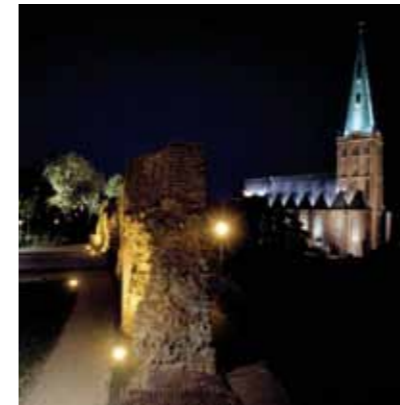
2007 - Heinsberg - Germany