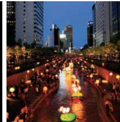
2008 - Seoul - Korea