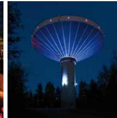
2009 - Jyväskylä - Finland