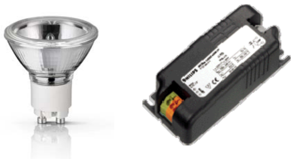
CDM-R Mini 20W/830